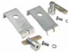
Bolt-On PAL PAK